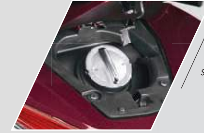
DOUBLE LID EXTERNAL FUEL FILL

One compact console ensures safety of the vehicle and convenience of opening underseat storage & external fuel lid.